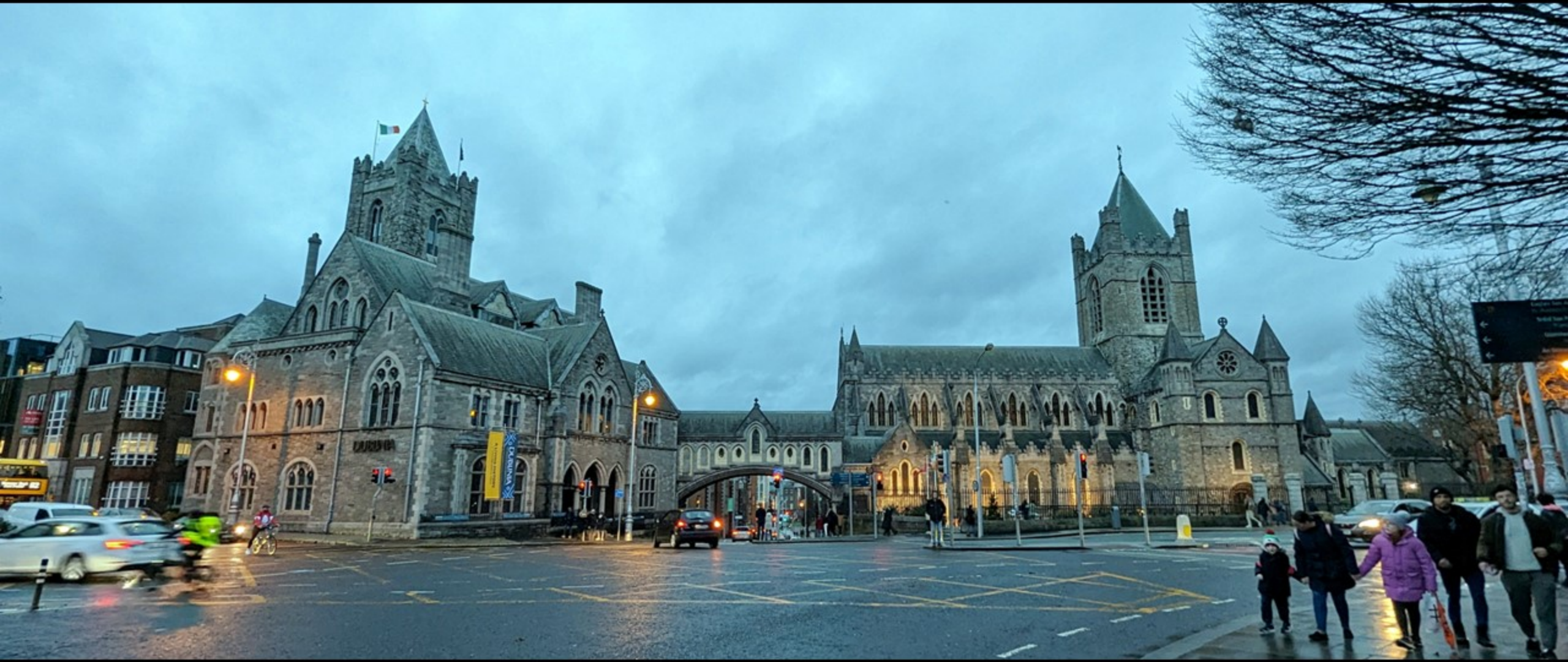
Christ Church Cathedral