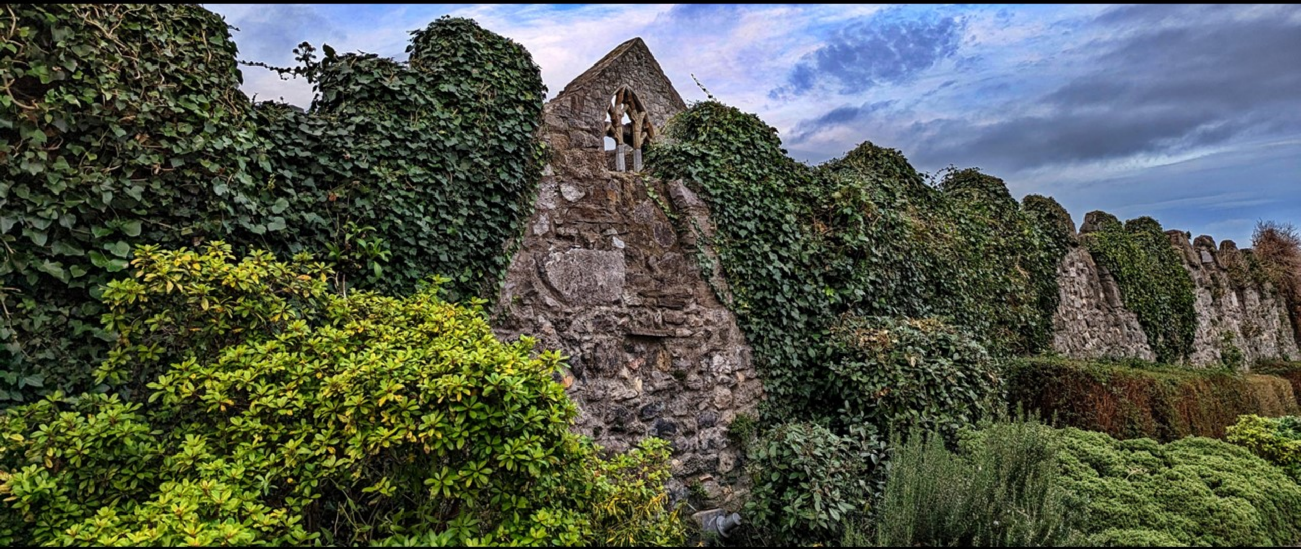
St. Mary's Abbey