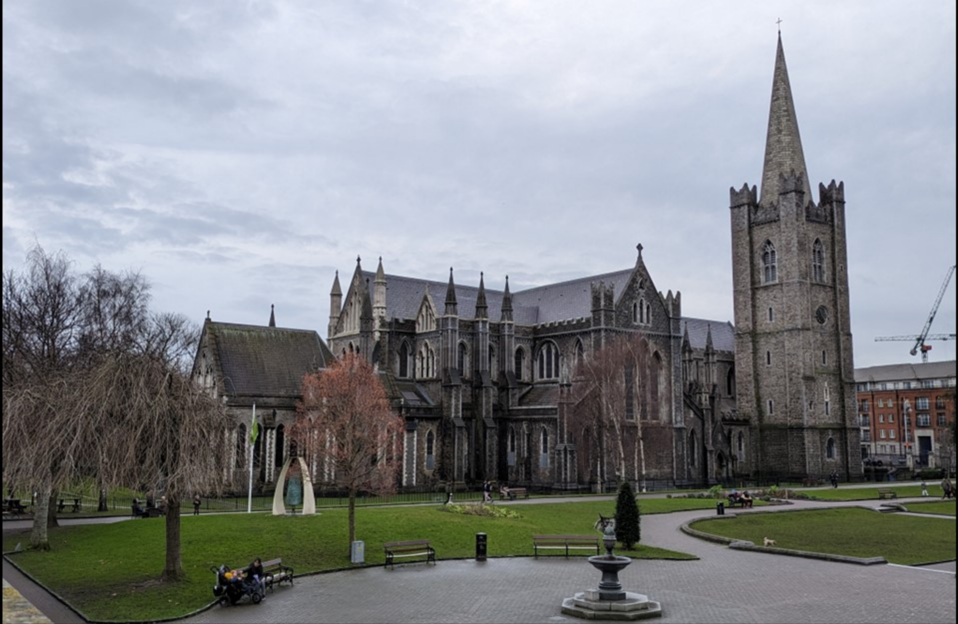
St. Patrick's Cathedral